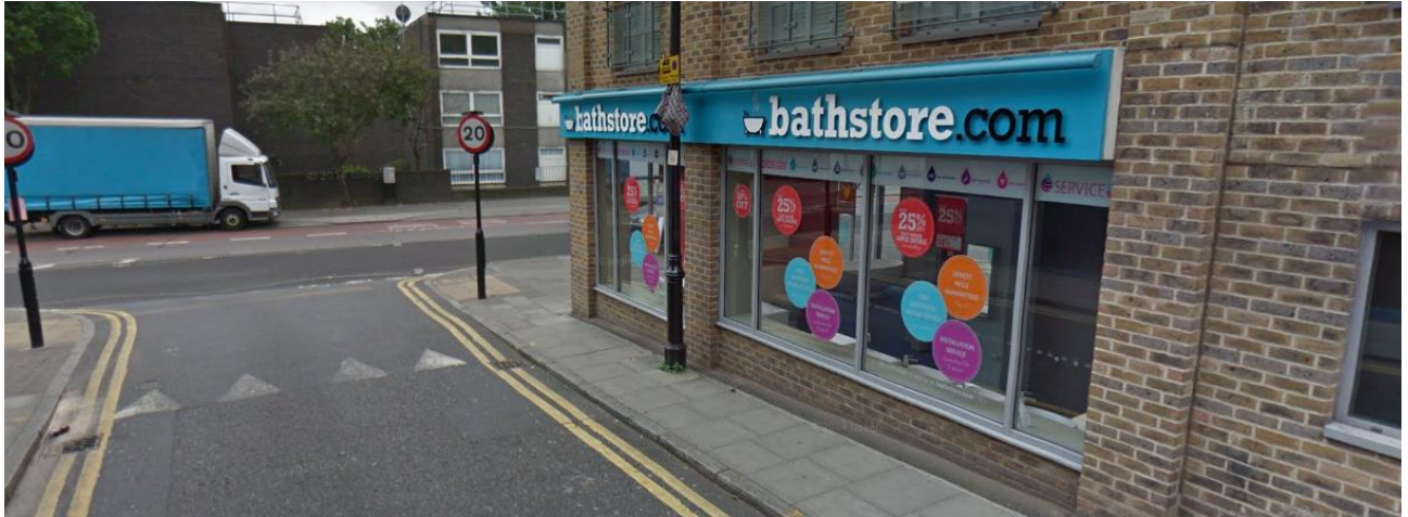
Image 4. Photo of application site as seen from Gaskin Road